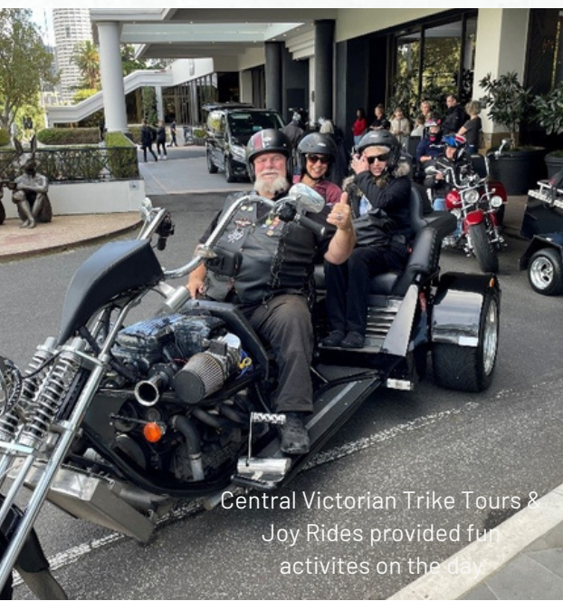
Central Victorian Trike Tours & Joy Rides provided fun activities on the day

Work has already commenced on the next event which is planned for 2024 in Queensland.