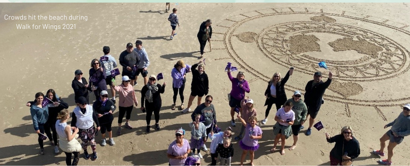
Crowds hit the beach during Walk for Wings 2021