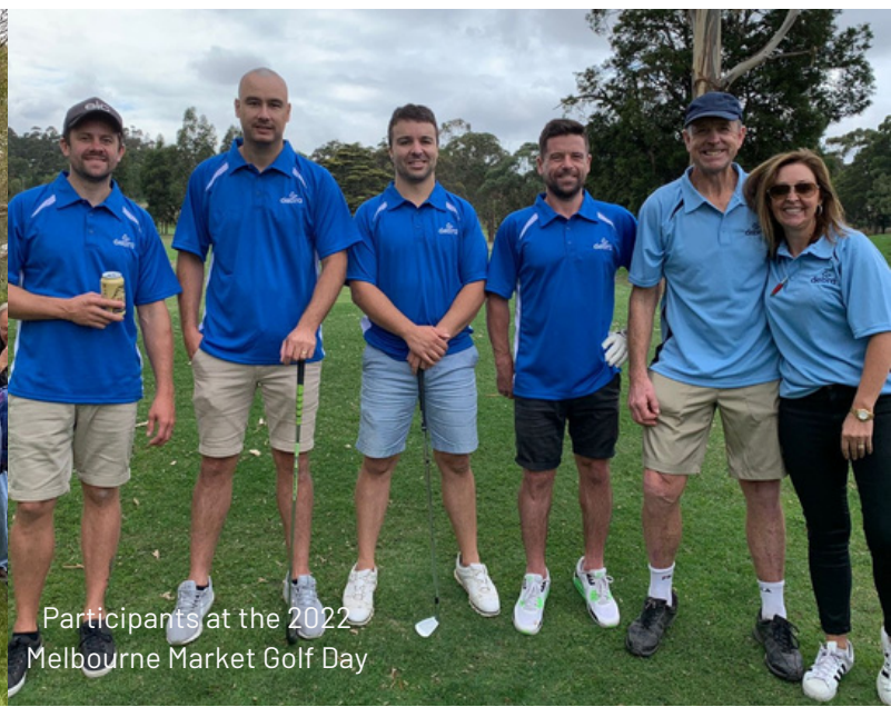
Participants at the 2022 Melbourne Market Golf Day