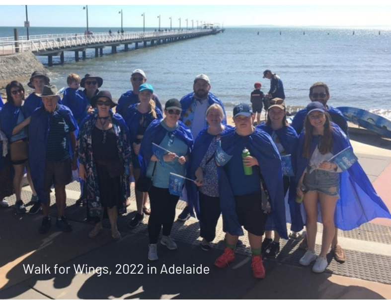
Walk for Wings, 2022 in Adelaide

We also greatly appreciate the continued support of Brighter Days and the Melbourne Market Golf Day, which both went ahead in 2022. The Brighter Days event once again was the highlight of many supporters' calendars and the Melbourne Market golf day returning post Covid also had a great attendance.