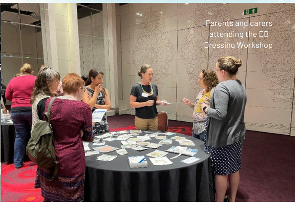
Parents and carers attending the EB Dressing Workshop