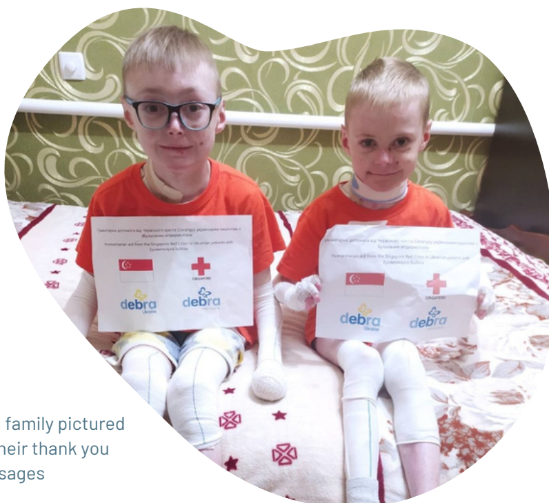
A Ukrainian EB family pictured above with their thank you messages