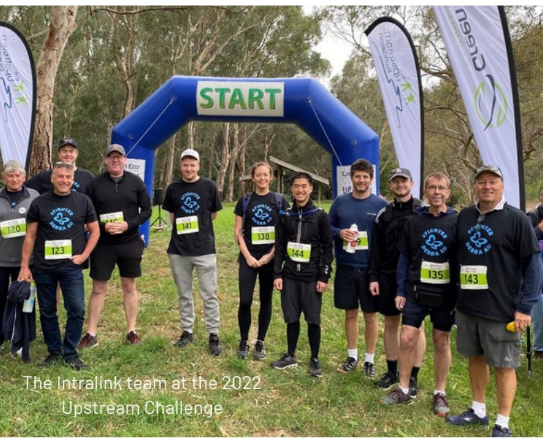
The Intralink team at the 2022 Upstream Challenge

DEBRA Australia continues to feature across aligned-organisations websites and newsletters, including; Wounds Australia, Australasian College of Dermatologists, Rare Voices Australia, DEBRA International and more.