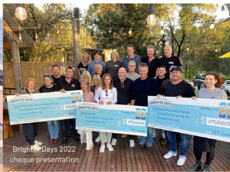
Brighter Days 2022 cheque presentation