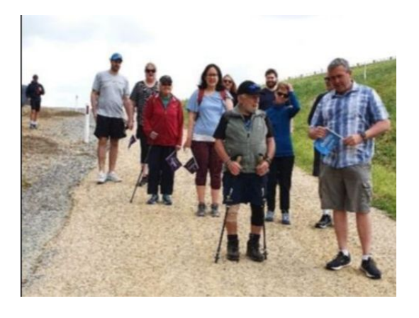
Our amazing supporters supporting Walk for Wings and our Trivia night.