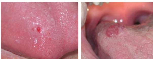
Images 18 and 19 Blood-filled bullae on the tongue in patients with DDEB.

RDEB inversa subtype is an uncommon form of EB. Patients present with mucosal blistering (especially sublingually), ankylo-