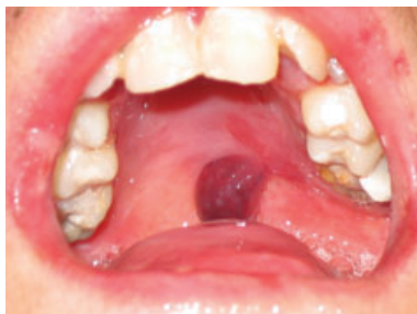
Image 22 Blood-filled bullae on the palate of a patient with RDEB.