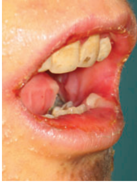
Image 27 Limited mouth opening in RDEB.

likely that it reflects the scarring of the buccal and labial mucosa and commissures 1,5,9,28 .