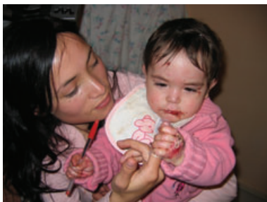
Image 2 Early oral hygiene instruction.

Patients with EB should be referred to a dentist as early as possible to identify any feature related to EB that needs special attention, for example, generalized enamel hypoplasia 5,10-13 . This enables dentists to start preventive programmes and reduces the risk of developing dental diseases 14 . Many case reports have shown that patients visit the dentist only when they already have several carious lesions or pain 7,11,15,16 .