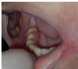
Image 7 Ulcer on the tongue and commissure of a patient with JEB.

Mucosal and skin fragility vary considerably between subtypes of JEB and patients, and the avoidance of adhesive contact with the skin and careful manipulation is always advised. Following the suggestions listed in 'Recessive DEB' can be of help for these patients as well.