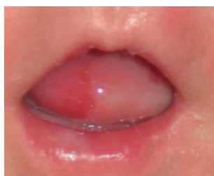
Image 23 Serosus bullae covering more than half of the tongue of a newborn with RDEB.

labial and buccal vestibules 4,7,9,11,12,18,19,22,23,27,28,31,36,41 and hence has the potential to compromise oral hygiene procedures, dental treatment, and the wearing of removable prosthetic appliances (Image 26).