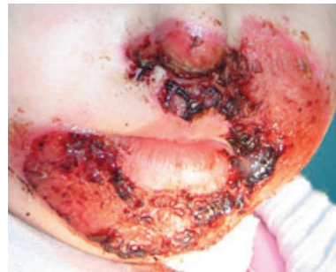
Image 9 Two-year-old patient with JEB and severe perioral granulation tissue.

This group of patients will require a special dental rehabilitation plan, as they present with generalized enamel hypoplasia (Images 8 and 9).