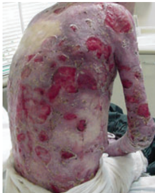
Image 31 Ulceration and scarring in JEB.

sion with little or no palpable dermal component, similar to other wounds on the skin, or mimic areas of granulation tissue 26 (Image 33).