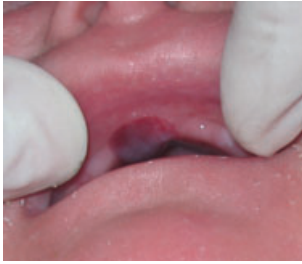
Image 1 Early diagnosis and education to parents on bullae management.

Patients with EB should be referred to the dentist for the first consultation at the age of 3–6 months. The first consultation should be aimed at: