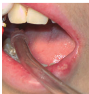
Image 10 Suction tip leaned on tooth surface to avoid mucosal sloughing.

D Extreme care of fragile tissues is important. To handle tissues, a little pressure (compressive forces) can be applied, but no sliding movements (lateral traction or other shear forces) should be used, as these can cause tissue sloughing 5,11,23 .