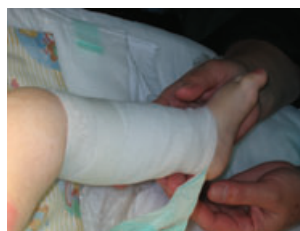
Image 40 Secondary bandage to absorb humidity.