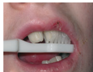
Image 5 Collis Curve (TM) toothbrush brushing the palatal and buccal sides of the tooth simultaneously.

patients with EB 5,7,10,11,16,19,20 . It has shown to be effective for candida while ineffective for caries control.