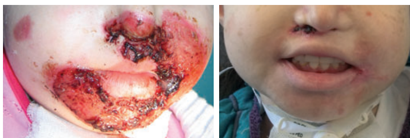
Images 14 and 15 Area of perioral granulation tissue in a patient with JEB at the age of 2 and the same patient at the age of 9.

Most patients develop blisters and ulcers on the oral mucosa during infancy, which can cause difficulties eating and performing oral