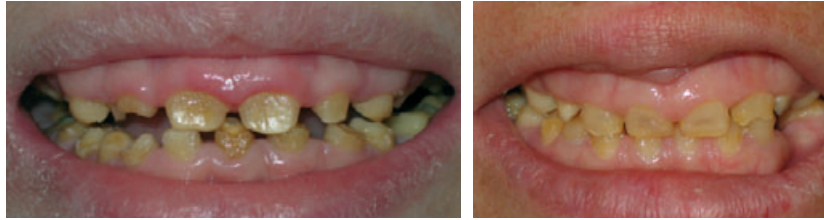
Images 16 and 17 Generalized enamel hypoplasia in patients with JEB.

hygiene; but after puberty, the oral mucosal condition tends to ameliorate. Few patients have continuous blister formation on the oral mucous membranes. These blisters heal without scarring 73 .