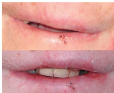
Image 11 Before and after fixed crown restoration.