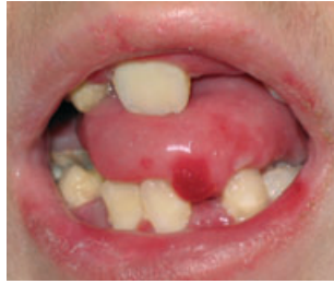
Image 20 Blood-filled bullae on the tongue of a patient with RDEB.