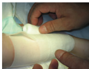
Image 41 Gauze wrap to keep bandages in place.

should not be picked up under the arms, but be lifted from the bottom and the back of the neck. Clothing should be made of soft fabric and simple design 26 .