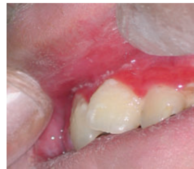
Image 26 Obliteration of the labial vestibule in RDEB.