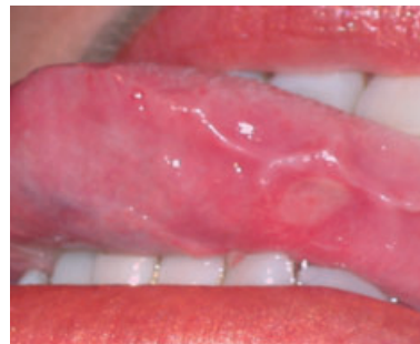
Image 13 Ulcer on the lateral border of the tongue in a patient with EBS.

Only one report of this uncommon subtype of EBS included details of oral features. The patient had lost her teeth, which had enamel