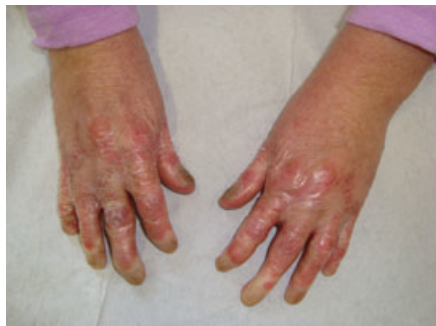
Image 43 Post-operative results of hand surgery in a patient with RDEB.

dietitians and dentists work as part of the multidisciplinary team, giving sensible advice to limit consumption of sweets to the end of meals, discouraging sipping of sugary drinks between meals, and giving appropriate advice regarding the prescribing for fluoride supplements and chlorhexidine 98 .