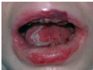
Image 12 Bullae, ulcers, and mucosal sloughing after surgical extractions.

possible and all the special precautions, mucosal sloughing and blister formation have been reported after almost every surgical extraction in patients with severe RDEB 1,9,22,30,41 . Blisters can arise at the angles of the mouth, lips, vestibule, tongue, and any sites of manipulation (Image 12); some measuring up to 4 by 3 cm 1,30 . In some instances, they might only be noticed by the patient or carer only on the second post-operative day 9 .