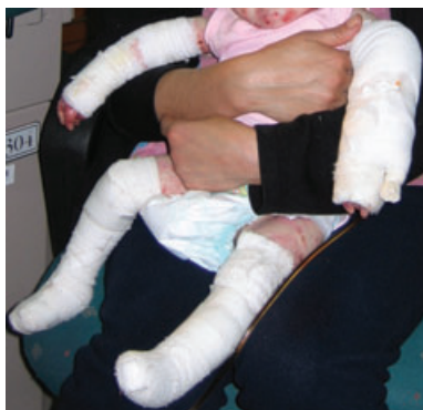
Image 38 Bandages on the four limbs to prevent trauma.