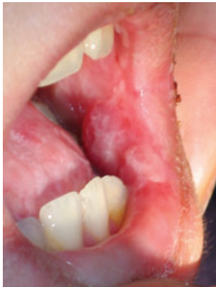
Image 21 Bullae on the buccal mucosa of a patient with RDEB.