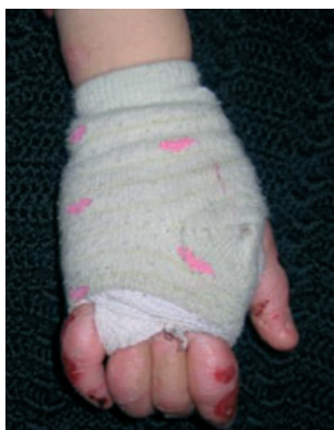
Image 37 Hand wrapping to prevent webbing.