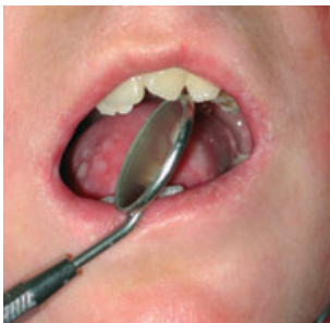
Image 6 Microstomia makes the access to the oral cavity difficult.

Limited mouth opening has been reported as the greatest clinical difficulty for providing dental treatment 23,24 as well as complicating intubation (Image 6) 25 . In this context, the