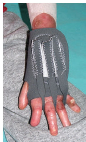
Image 42 Splint to prevent webbing in RDEB.

Nutritional support: Proactive nutritional support aids resistance to infection, growth and sexual maturation, wound healing, and over-