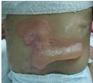
Image 30 Extensive bullae covering the back of a patient with RDEB.