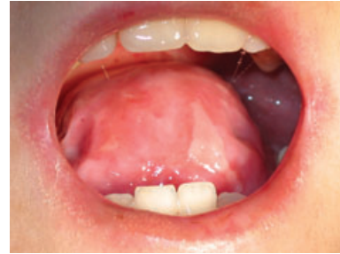
Image 24 Absence of tongue papillae in RDEB.