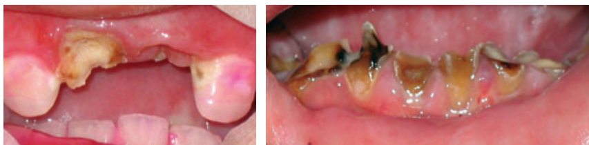
Image 28 and 29 Severe caries in a 12-year-old and a 20-year-old patient with RDEB.

Facial Growth. The cephalometric analysis of 42 patients with RDEB, seven gen indicated that