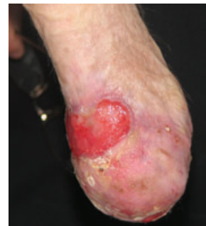
Image 33 Squamous cell carcinoma in RDEB.

junctival blisters and erosions, symblepharon, eyelid blisters and scars, ectropion, and lacrimal duct obstruction. Marked visual impairment can result from repeated injury to the cornea, especially if scarring develops 26 .