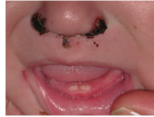
Image 3 Early diagnosis of Generalized Enamel Hypoplasia in JEB.