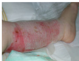
Image 39 Primary bandage.