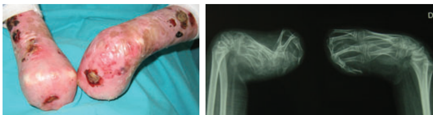
Image 35 and 36 Mitten deformities in RDEB.

Acral deformities: Pseudosyndactyly is the most visible extracutaneous complication of inherited EB and is primarily seen in RDEB. These progressive deformities can cause marked functional disability (Images 35 and 36) 26 .