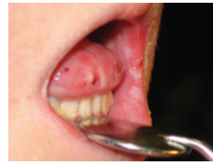
Image 25 Ankyloglossia in RDEB.