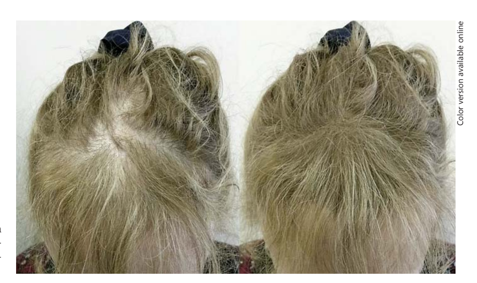
Fig. 1. Patient 1, a 41-year old woman with generalized intermediate JEB and scalp alopecia before and after the topical application of pigmented hair-thickening fibers.

Hair-thickening fibers are one of many new ways to conceal alopecia [6], and Cossman et al. [7] have recently published a study about the effectiveness of hair-thickening fibers in camouflaging areas affected by androgenic alopecia. Hair-thickening fibers work by bonding to the hair by static electricity to make it appear thicker and fuller as well as by sitting on top of the scalp to provide direct