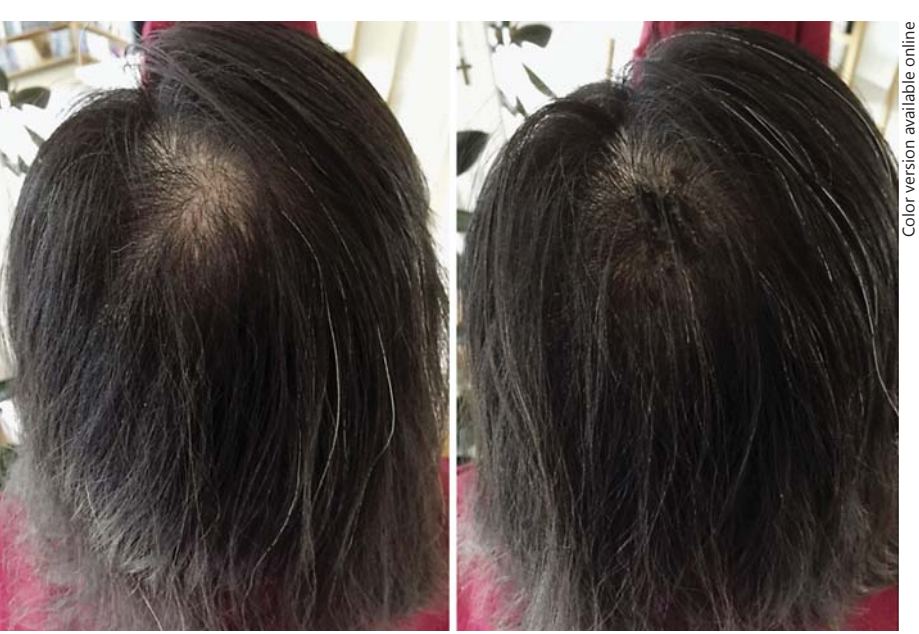
Fig. 3. Patient 3, a 47-year old woman with RDEB inversa and scalp alopecia before and after the topical application of pigmented hair-thickening fibers.

camouflage (fig. 4) [8]. The hair-bonding property is a major benefit over other camouflaging techniques but has limited utility in areas of complete hair loss such as in patients with alopecia areata. Hair-thickening fibers tend to be made from either keratin or plant materials, which are dyed in a range of colors to match the patient's hair color. Manufacturers report irritation to be low, and some advocate for a fixative spray to be applied on top of the fibers to improve stability. In our group of patients, we did not use a fixative spray because of concerns about skin irritation. We would also advise against applying hair-thickening fibers to areas of blistered skin or wounds as this could lead to sensitization and future contact allergy to dyes within the fibers.