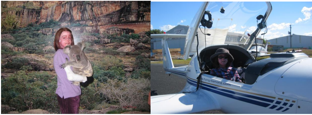
CARMEL AT THE SUNSHINE COAST